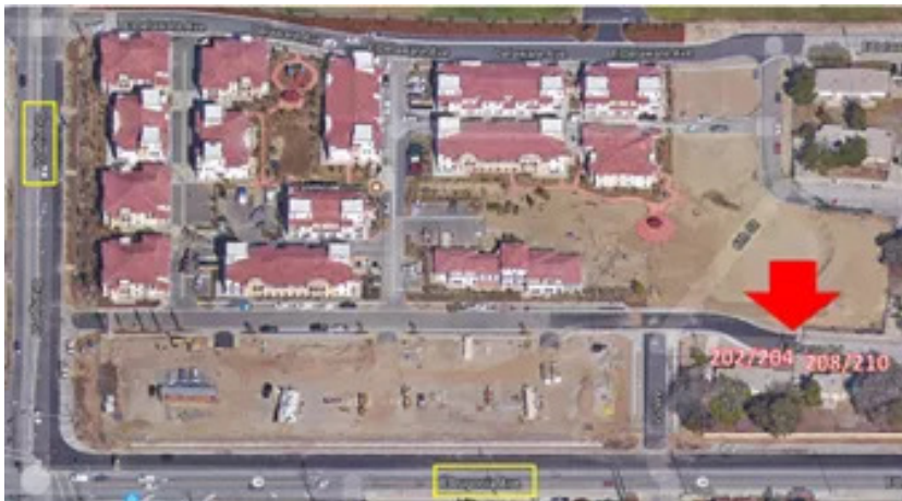
The Redlands Fire Department will conduct live fire training at a vacant apartment complex near Orange Street and Lugonia Avenue Saturday, Nov. 4 through Tuesday, Nov. 7.

The San Bernardino County Housing Authority has donated the apartments to the Fire Department for training prior to the scheduled demolition of the buildings.